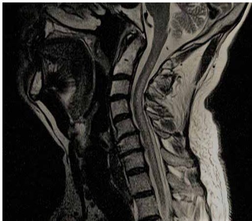
Figure 1. MRI changes signifying demyelination of the posterior cord.

Indeed, Lichtheim's disease can be seen with various presentations; however, most cases present with a gradual onset of symptoms. The uniqueness of this case is its acute presentation. With only limited exposure to nitrous oxide, the patient experienced an abrupt paralysis in his extremities, unusual for patients with this condition. This case exposes the toxicity behind nitrous oxide and urges individuals to use them with caution.